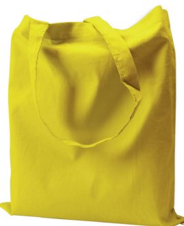
COTTON CARRIER BAGS