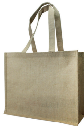
JUTE CARRIER BAGS