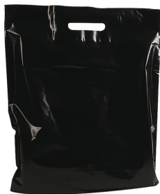
PLASTIC CARRIER BAGS