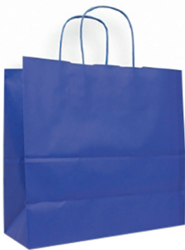
PAPER CARRIER BAGS