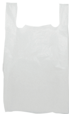
T-SHIRT CARRIER BAGS