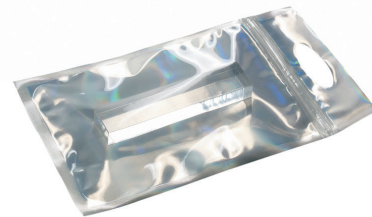
RESEALABLE CARRIER BAGS