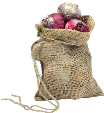
JUTE CORD CARRIER BAGS