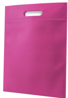
NON-WOVEN CARRIER BAGS